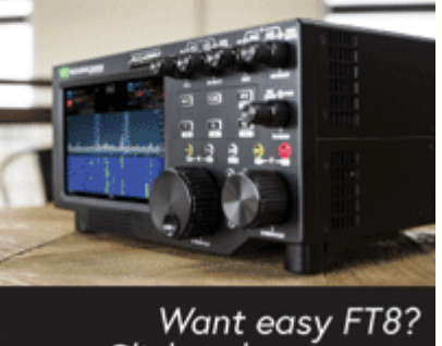
Click to learn more.